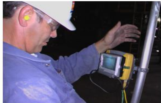
Operators of plant containing high-energy piping face challenges in keeping it in optimum condition