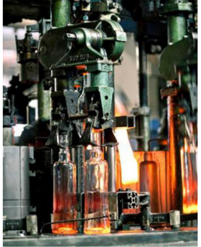
HRL provides expert chemical analysis services to support glass production

dedicated sample preparation for raw-material and glass samples