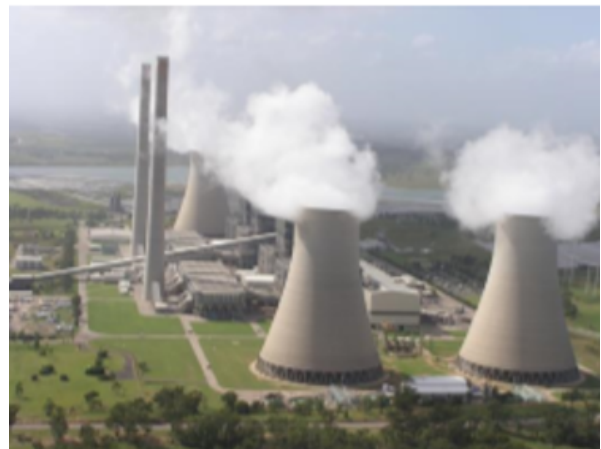
Bayswater Power Station

The performance of the Attemperating Spray System exceeded the expectations of both HRL and Bayswater Power Station.