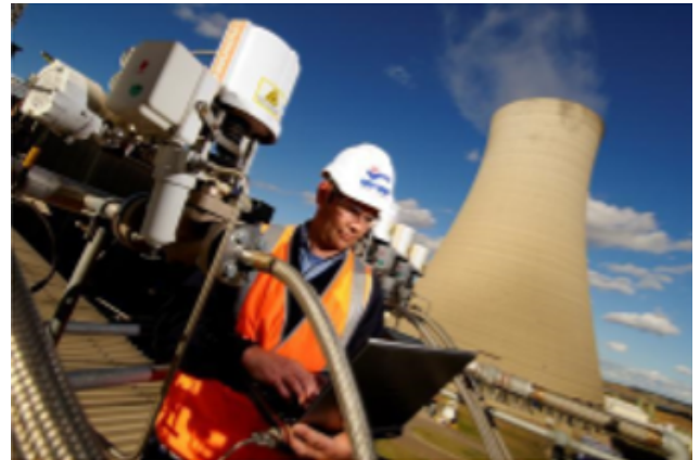
Implementing the solution